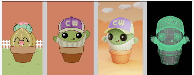
Cactus Seed Investor Kit

Cactus World will offer the opportunity to be part of a kid friendly TV show with your own, unique cactus character. Collectors will be able to buy a Cactus Seed NFT, which makes them a Founder of Cactus World, benefitting from exclusive rewards, intellectual property revenue sharing and access to the Cactus World community through the exclusive Discord channels. They also get a rare Cactus World collectable 2D NFT, and a matching 3D model that can be used in the metaverse and featured in the show. As the world and community grows the super cute cactus NFTs will find their place within a new TV show, game, metaverse and currency.