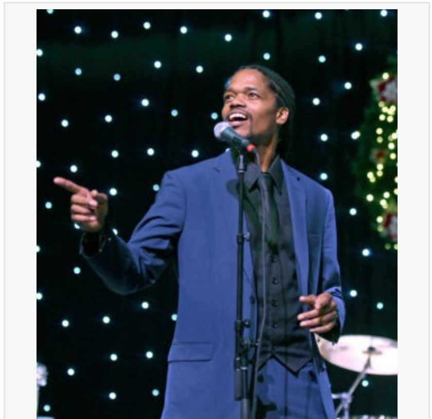
Season six winner of NBC's America's Got Talent