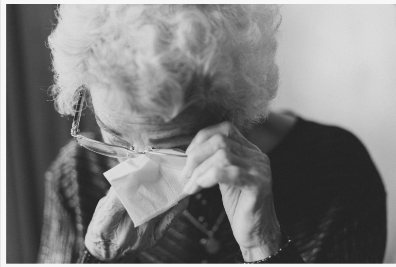
More than 15,000 of Florida's elderly, including those with dementia, were sent for involuntary psychiatric examinations in 2018/2019.

More than two decades ago the Florida Legislature and the Florida Supreme Court investigated the abusive use of the Baker Act involving the elderly, with the Florida Supreme Court recommending that the statutes be amended "to expressly permit the use