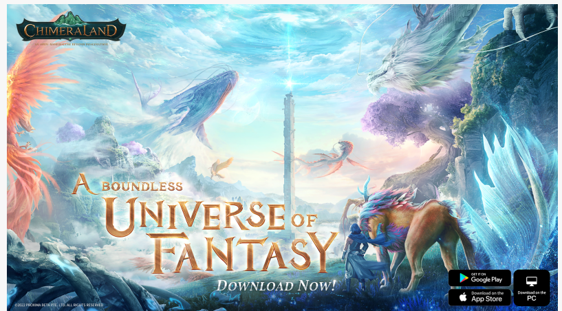
Chimeraland is now available

anticipation and excitement have been building based on the comments on our social media