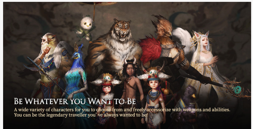
Image_ Be Whatever You Want to Be