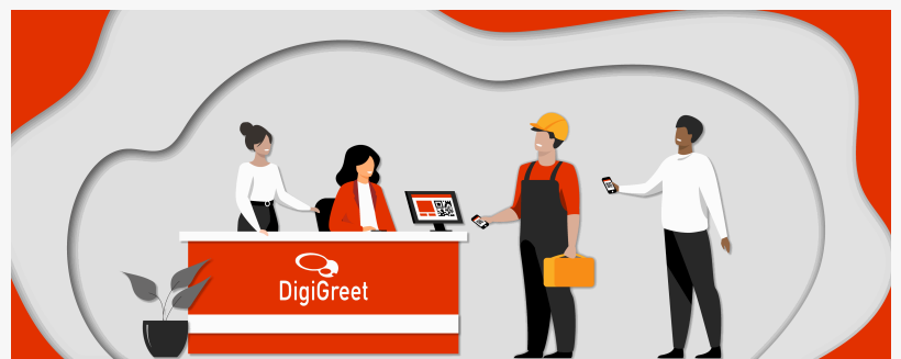
Contractors are entering at site office

Apart from checking the Covid Pass and issuing and keeping track of contractor permits, the DigiGreet visitor management system also allows businesses to store all the necessary documents of contractors which are uploaded by the contractors in advance of their visit. This