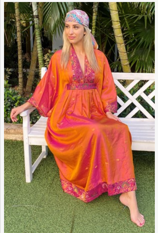
MORPHEW Collection Sari

MORPHEW VINTAGE represents the finest collection of investment vintage fashion. Sourced globally, the collection dates back to the early 1900's. Each piece is selected with both quality and rarity in mind. MORPHEW assures that from rare Victorian laces to the most coveted designer collections, each piece authentic, well-documented, immaculately cared for and represents an important and valuable moment of fashion history.