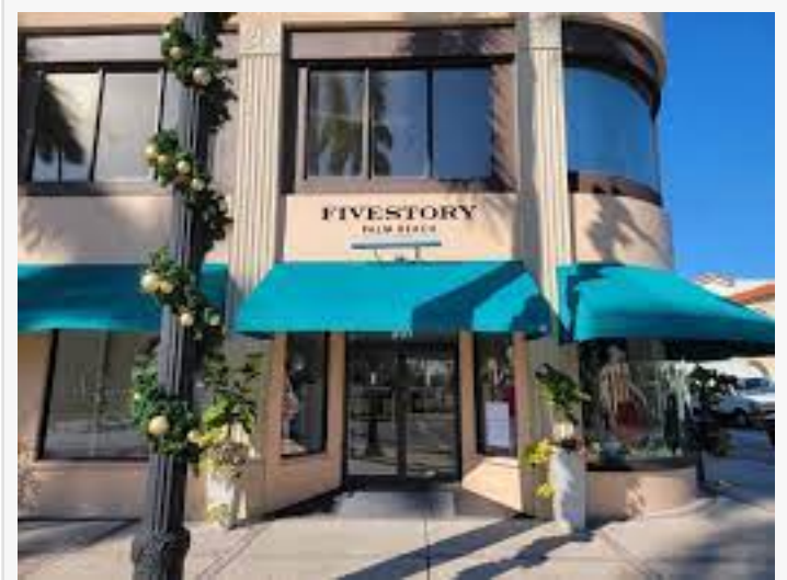
Fivestory Palm Beach

Trusted tastemakers since 2013, MORPHEW is an inspirational lifestyle brand collecting the most unique and inspired pieces of fashion’s most iconic moments from around the globe, all sourced with any eye towards modern trends. Long known as the “insider’s insider” and regarded as the perennial industry darling, they are a “go to” resource for film, television, celebrities, and stylists.