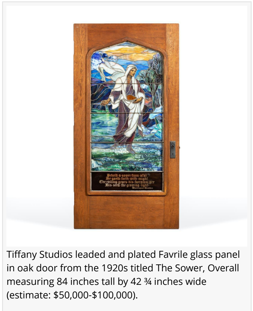
Tiffany Studios leaded and plated Favrite glass panel in oak door from the 1920s titled The Sower, Overall measuring 84 inches tall by 42 ¾ inches wide (estimate: $50,000-$100,000).

• An exuberantly and mythically carved Italian Renaissance Revival walnut secretary desk by