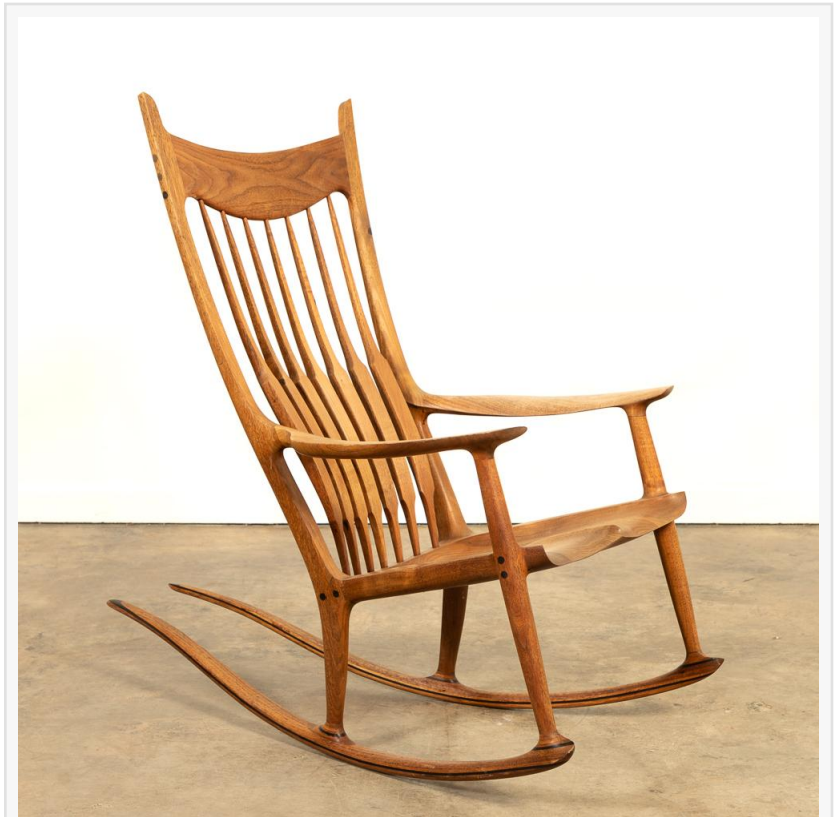
Walnut rocking chair with ebony accents by Sam Maloof (American, 1916-2009), signed, dated. Similar rockers by Maloof can be found in museum collections (estimate: $25,000-$35,000).