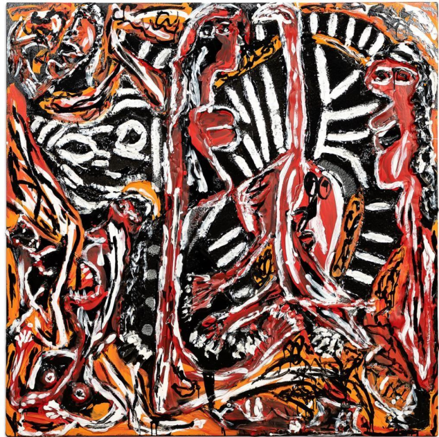
Paint and mixed media on canvas by Thornton Dial (American, 1928-2016), titled Struggling Tiger (The Tiger Penned In) titled on verso, 60 inches by 60 inches (estimate: $30,000-$60,000).

Start times all three days will be 10 am Eastern time. Session 1, on Friday, January 14th, offers the estate of a prominent Atlanta interior designer. Session 2, the following day, will feature Modernism, estate jewelry, Asian arts, fine furs, African arts, vintage movie posters and advertising posters. Session 3, on January 16th, will contain period antiques and fine art.