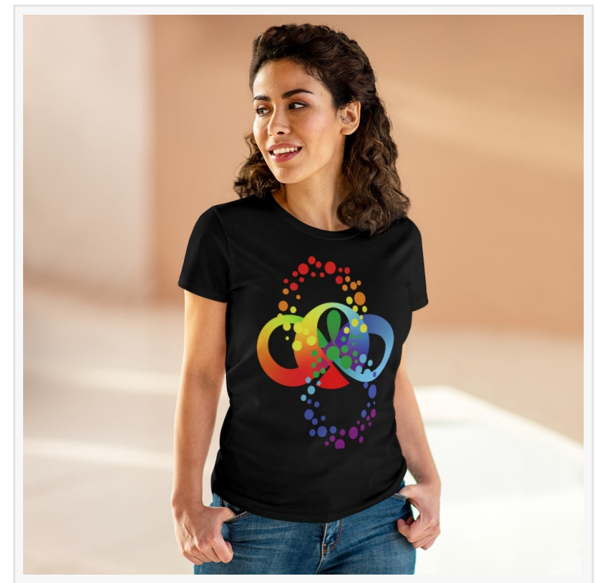
From the Autism Awareness Collection

Shop the Autism Awareness Collection on Owl Century, and check out the retailer's offerings for <u>women</u> and <u>men</u>. Follow Owl Century on social media at @owlcentry on Instagram and