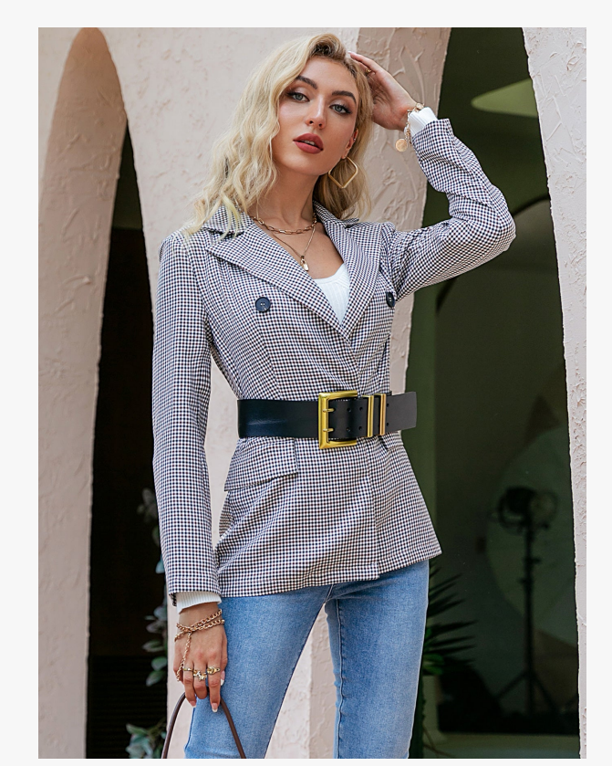
From the Owl Century Women's Collection

Facebook. For media requests, please contact info@owlcentury.com.