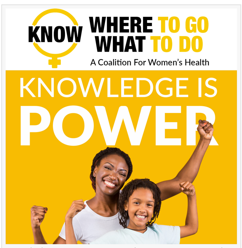
Knowledge is Power -Know Where to Go, Know What To Do

FT LAUDERDALE, FLORIDA, UNITED STATES, January 6, 2022 /EINPresswire.com/ -- Finding the most reliable and trusted health resources, education, and support can be a challenge, especially for busy women, so today, 16 women's health-focused organizations announced the launch of Know Where to Go, Know What to Do, a coalition of mission-driven organizations with a single shared mission: to educate and empower women to take responsibility for their well-being, understand their health, and increase awareness of their unique health needs. By joining together, this coalition provides education, support and tools to help women prioritize their health across all spectrums of wellness.