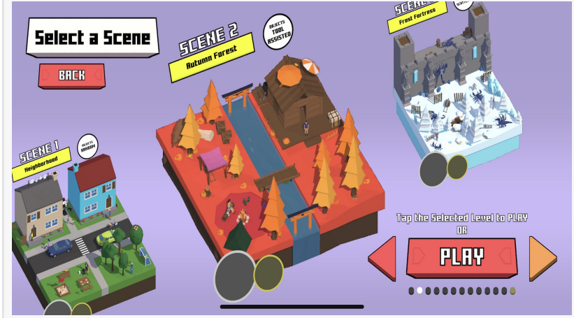
3D Hidden Object Challenge Scenes 1 - 3