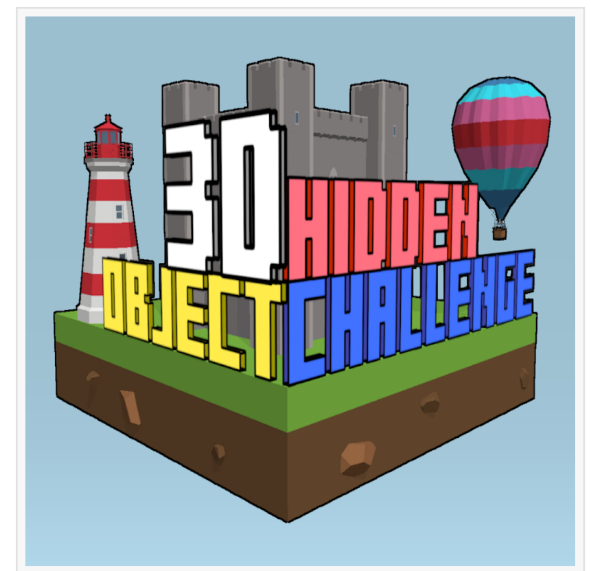
3D Hidden Object Challenge Icon

Optionally shares your accomplishments via email, or text messaging (iOS, Android, and PC).