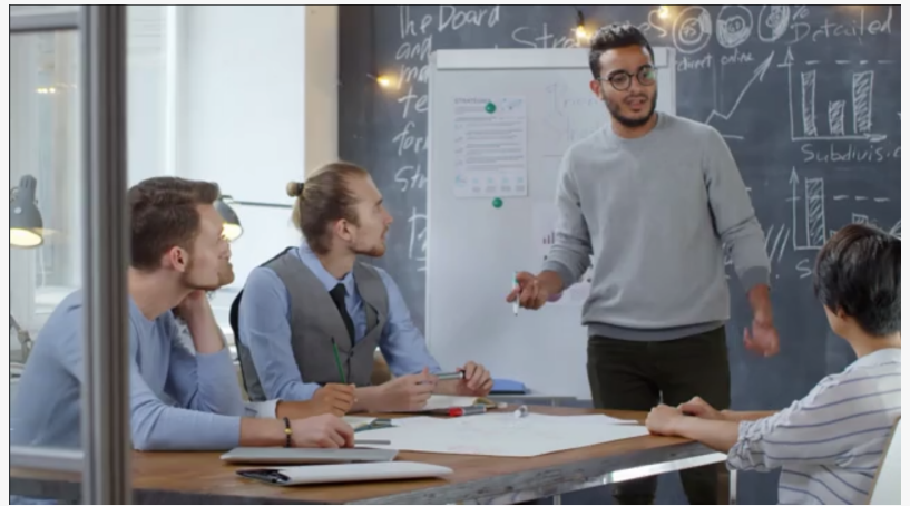
Group Health Insurance Frisco