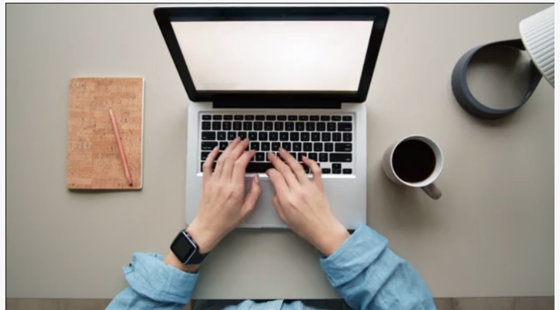
Frisco Health Insurance Agent