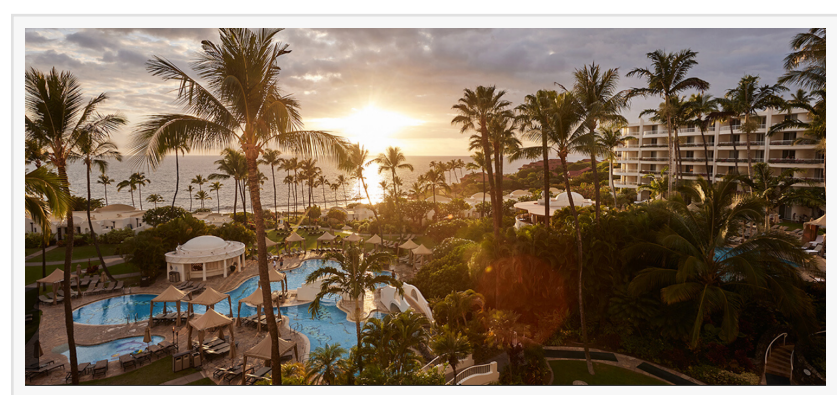
Magnificent Fairmont Kea Lani Hosts "The Magical Mystery Show!" Theatre -- Opens in February

WAILEA, HAWAII, UNITED STATES, January 8, 2022 /EINPresswire.com/ -- It is with great pride and honor that HOTEL MAGIC LLC announces our first official venue in Hawai□i to host The Magical Mystery Show! Beginning Feb