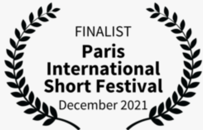
Paris Women Festival