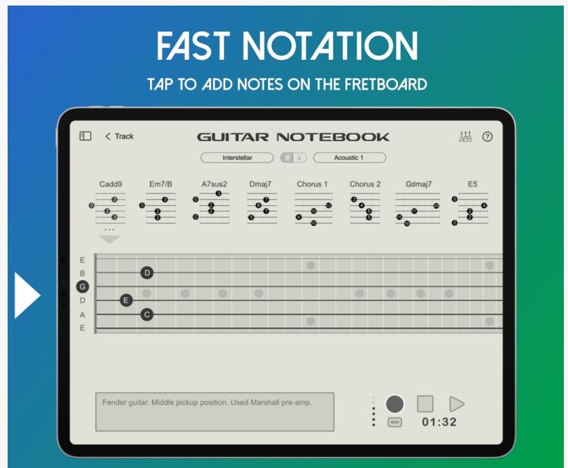
Add Notation - Paper Style