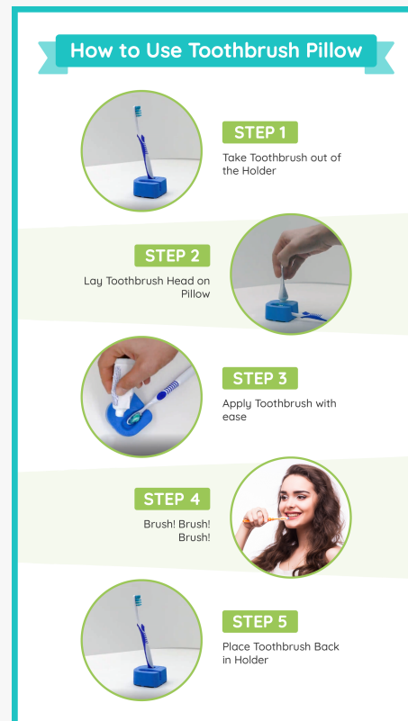
How to Use Toothbrush Pillow Diagram