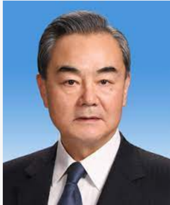
Chinese Foreign Minister Wang Yi.

The Chinese can seek to prevent any political resolution for the Tamils at the UN, but China should remember that Kosovo's separation was not sponsored by the UN, but rather by the U.S. and NATO, and standing in the way of Tamil independence will increase tensions with the