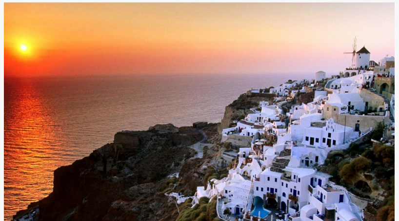
Santorini Private Sunset Tours