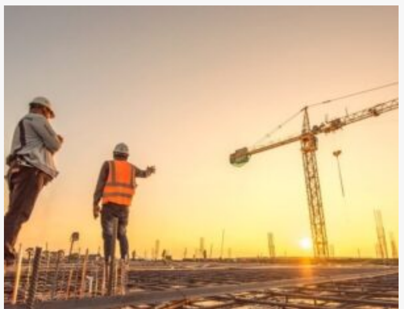
Facility Maintenance and Management

Comprehensive Architectural Services are delivered by Tejy Inc. in the USA involving the creation of drawings and models for all building types. Expert architectural design drafters implement Autodesk Revit, Autodesk AutoCAD, Solidworks, MicroStation and SketchUp to provide