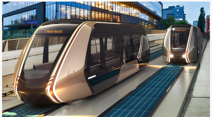
RAILBUS a state-of-the-art Vehicle

LEWES, DELAWARE, UNITED STATES, January 11, 2022 /EINPresswire.com/ -- Today, transportation in many cities is limited and inefficient. With low income and poor infrastructure, mobility is a major stumbling block for a country's economic development.