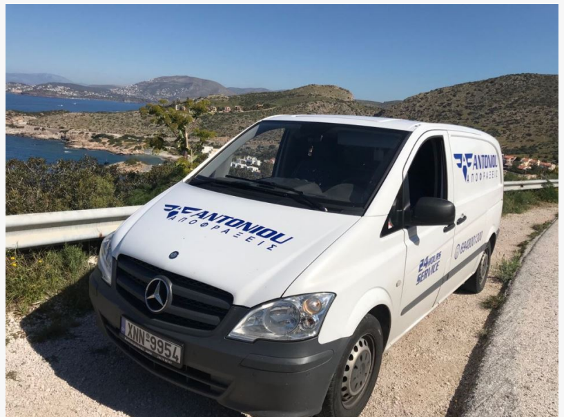
Apofraxeis Antoniou Athina