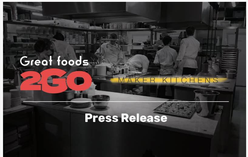
GREAT FOODS2GO AND MAKERS KITCHENS GROUP PARTNERSHIP

customers. GF2GO has 50 virtual brands and brightens people's days with great food daily. GF2GO was created to be highly scalable and repeatable in any market, satisfying customers and