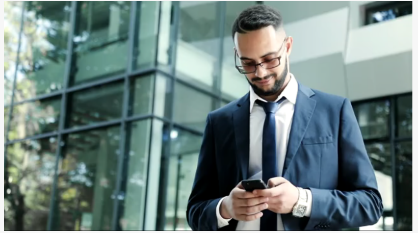
Health Insurance Arlington