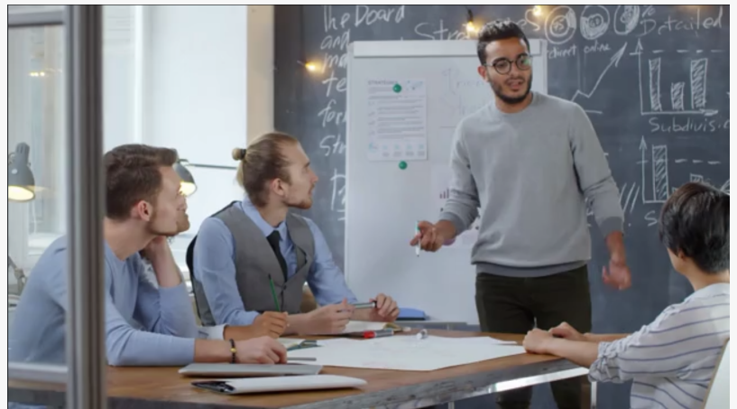
Group Health Insurance Arlington