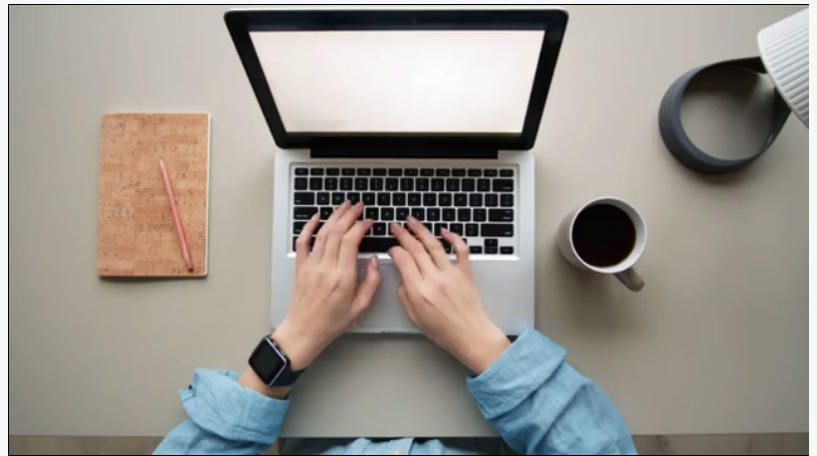
Arlington Health Insurance Agent