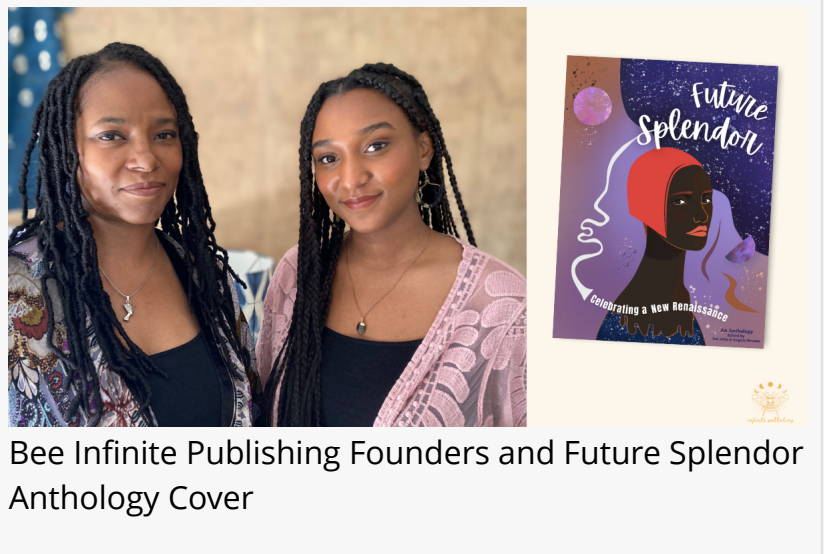
Bee Infinite Publishing Founders and Future Splendor Anthology Cover

LOS ANGELES, CA, UNITED STATES, January 11, 2022 /EINPresswire.com/ -- CatStone Books , a diversity-focused, non-profit press, will be matching donations to Black-women owned indie publisher Bee Infinite Publishing's Kickstarter campaign; an effort to fund three anthologies featuring Black, Latine/Latinx and people of color voices. This support builds upon CatStone Books' dedication to promoting and empowering minority voices in speculative fiction. On Twitter, the non-profit announced, "Let's work together! We will match every dollar given to this campaign. You give, we give. Everybody wins. While you're at it, go follow @beeinfinite_"