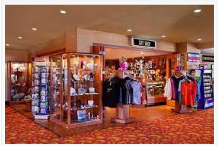
Gift Shops Need Your Products

The Start Of Sprint Data Solutions Worldwide Marketing From top to bottom, Sprint Data Solutions Worldwide Marketing is an Americanowned and operated business with a