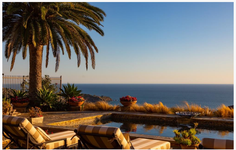
Flat fee realtors in Orange County

Hadi Bahadori, an Orange County-based real estate company, now presents a great package for individuals who want to list their homes for sale. Hadi Bahadori has decided that they will charge a flat fee of 1% listing fee to make the selling process convenient and pocket-friendly for clients. Selling a home without the help of an agent can be tough.