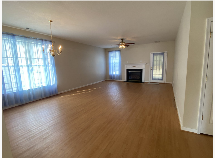
6611 Twin Cedars Ct., Fredericksburg, VA 22407

The real estate auction is open to the public. Brokers are reminded that pre-registration is required for compensation.