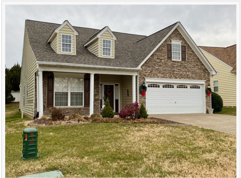
6611 Twin Cedars Ct., Fredericksburg, VA 22407