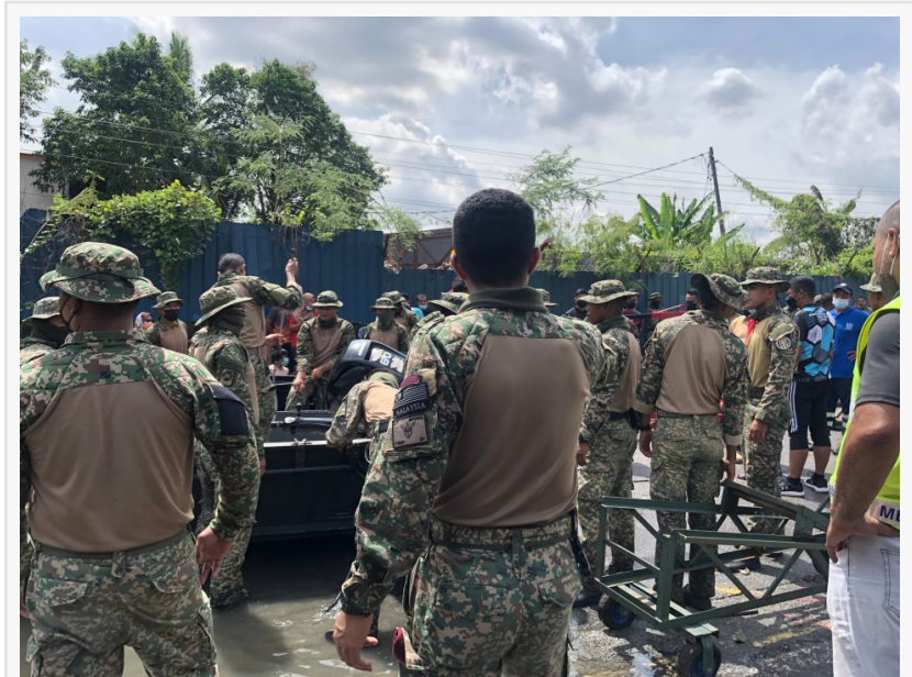
Volunteers and responders awaiting assignments for a search and rescue operation

Drakontas is a leading provider of command and control, incident management solutions to the domestic and international public safety community. Its DragonForce team collaboration platform delivers a tightly integrated set of powerful, yet easy to use tools on standard smartphones and web browsers. DragonForce's personnel tracking, tactical whiteboarding, digital forms, secure messaging, and file sharing empower first responders to make faster, safer, and more effective decisions and actions during day-to-day to large-scale incident operations.