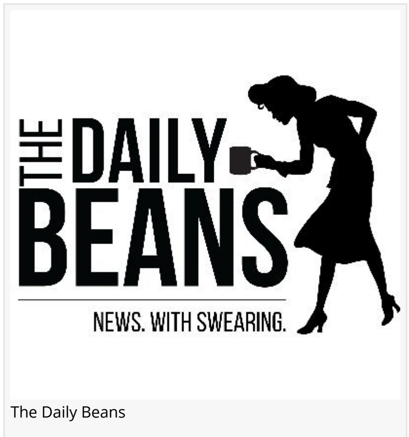
The Daily Beans