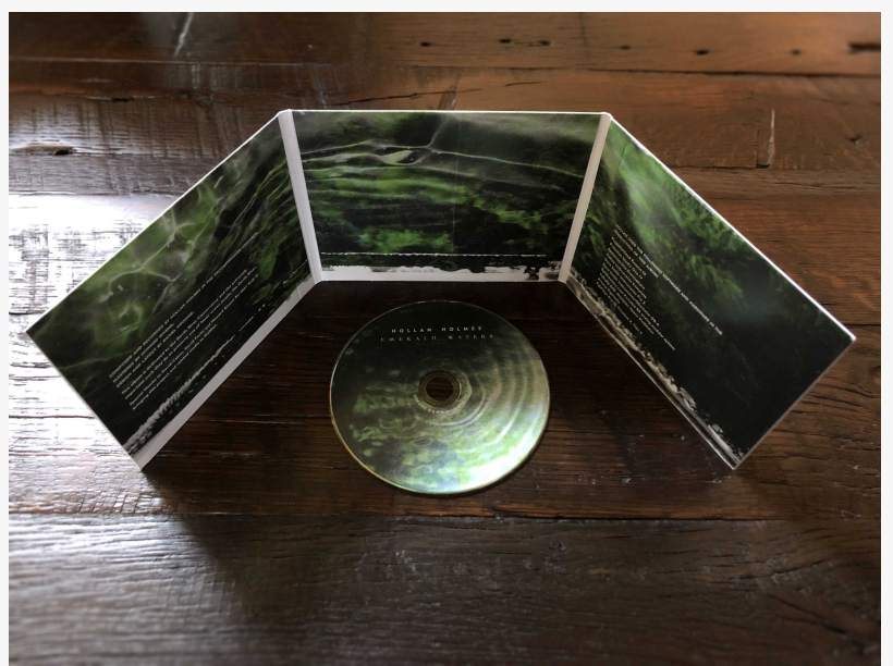
The collectible CD version arrives in a factory sealed 6-panel gatefold package with artful package design by Daniel Pipitone.

To recapture that moment in sound, Holmes used creative sound palettes like the Spectrasonics Omnisphere and Valhalla DSP Space Modulator, to paint the Emerald Waters in cosmic tones. "The River" like its namesake, is both restless and restful. A rippling sequencer entwines with a triumphant bassline to capture the constant motion of the current while a spritely melody evokes fractals of sunlight scattering across water. In another track, "Leviathan" is an ascent from the depths; first, a rumbling like a storm on the ocean floor, and then a swirling arpeggiation uncoils and rises, yielding an airy melody that gives a glimpse of the surface. Such is the nature of Holmes's inspiration where even flowing water through arid lands suggest a deep, imaginative experience that explores a universe of spatially evocative sound.