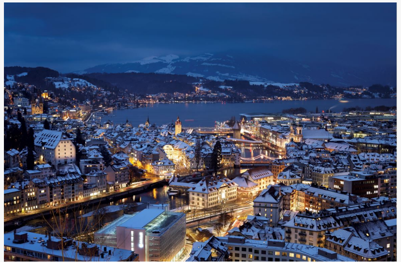
Lucerne, Switzerland, World Best International Business Location - 2022

World Biz Magazine, the global C-suite journal for the leaders of international companies, is pleased to announce that Lucerne, Switzerland has received the prestigious distinction of World's Best International Business Location for 2022.