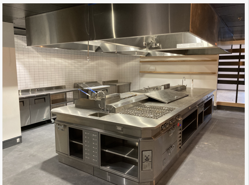
Gathered Foods test kitchen

With help from Framework, Gathered Foods ultimately selected space at The Yard, a new development in the revitalized St. Elmo warehouse district, housing community-minded businesses, local entrepreneurs, fresh tech ideas, and South Austin culture. The new Gathered Foods headquarters includes executive and communal workspace, meeting spaces, a culinary lab and test kitchen, back-of-house