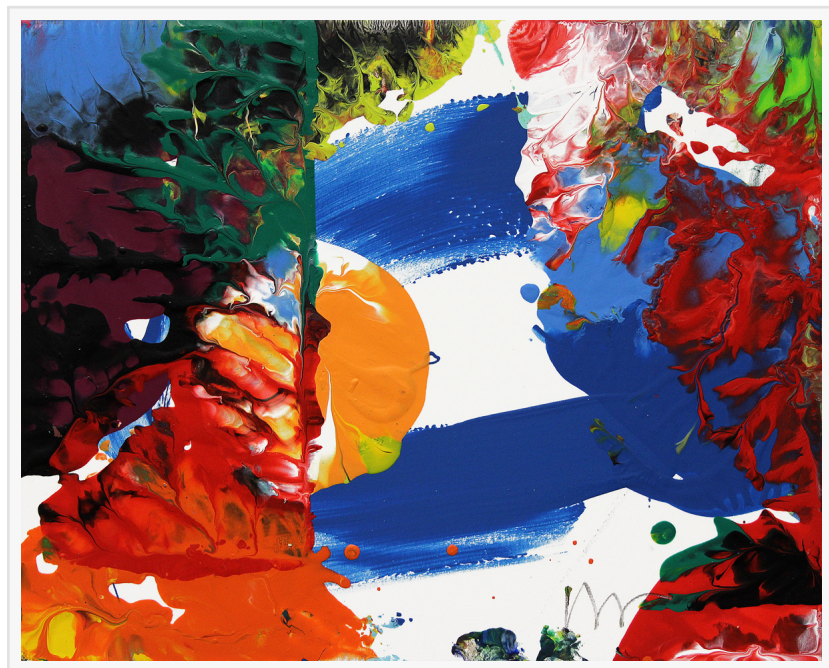
Clufffalo 345, 2020, latex on expanded PVC, 8 x 10 inches

With his art in the permanent collection of over 70 museums globally, including the National Gallery and The New York Metropolitan Museum of Art, going into the NFT marketplace –