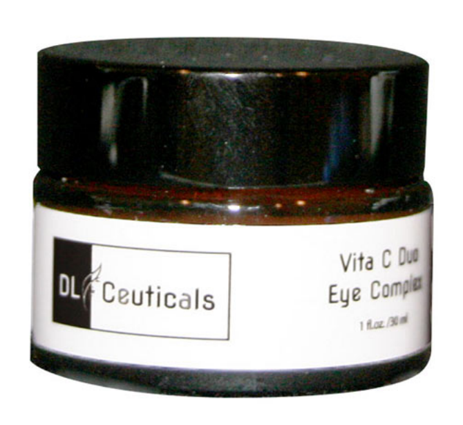
A gentle and effective treatment for the delicate eye area to revitalize skin and turn back the hands of time..