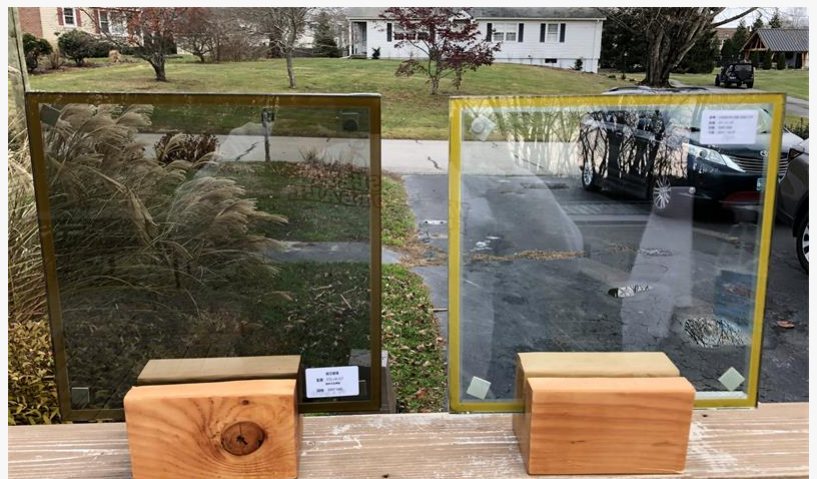
Tempered vacuum insulating glass manufactured by Morn BM