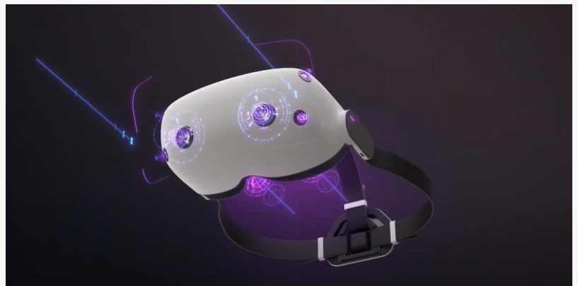
NEOM VR Kit prototype

The tech company, Neom Blockchain Technologies released its cryptocurrency on BitMart exchange.