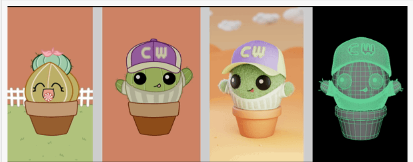
Cactus Seed Investor Kit

VANCOUVER, CANADA, January 16, 2022 /EINPresswire.com/ -- The cutest metaverse in the universe is about to launch! What have adorable cacti, 3D models and NFTs got in common? Well, they're all about to be part of the first-ever NFT TV show and so are hundreds of collectors, fans and curious non-cacti. The world of NFT (non-fungible tokens) has been growing and getting more and more creative, with artists, musicians and developers pushing the technology into uncharted territory. Now a pair of Oscar and Golden Globe winning VFX artists have created a visually stunning, irresistible and environmentally conscious way to get involved with the launch of Cactus World3.