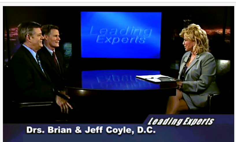
Leading Experts Interview

This press release can be viewed online at: https://www.einpresswire.com/article/560832609