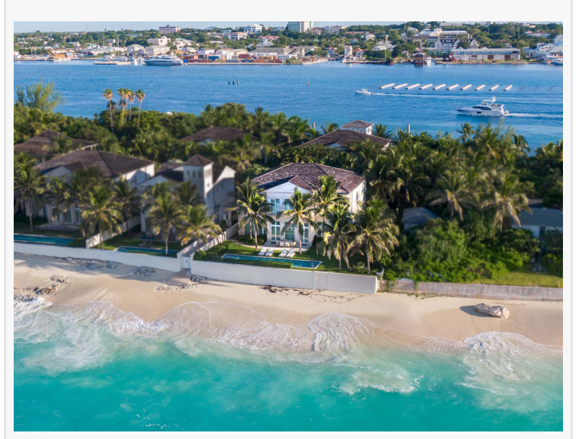
Tucked in a private enclave on exclusive Paradise Island