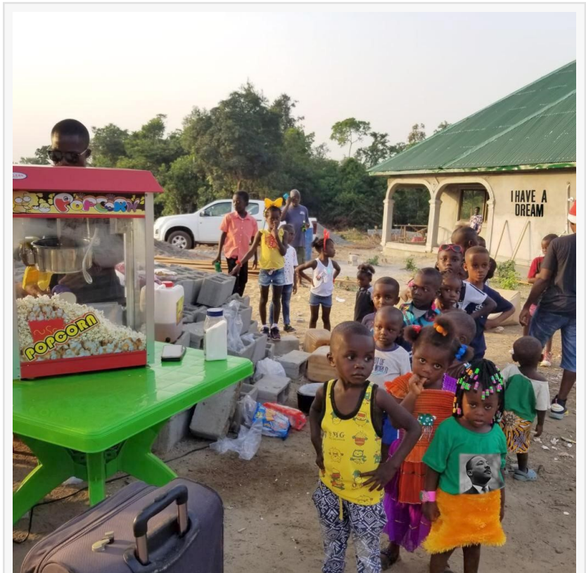
Children in Liberia Celebrate Martin King Birthday

Dr. Martin Luther King stresses the basic human rights not only for African Americans but for the humanity of women and children worldwide.