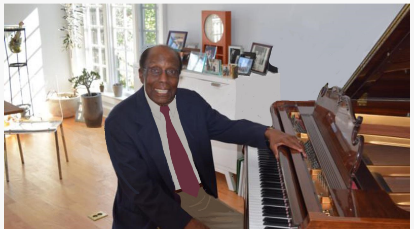
Winston the musician