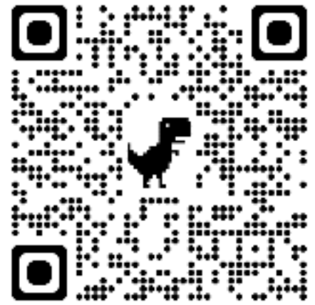
QR code Must APP

https://net-must.com/join-exhibition?uid=8d7f929d-34cd-4bb7-9db6-9e7c4a41c8ab