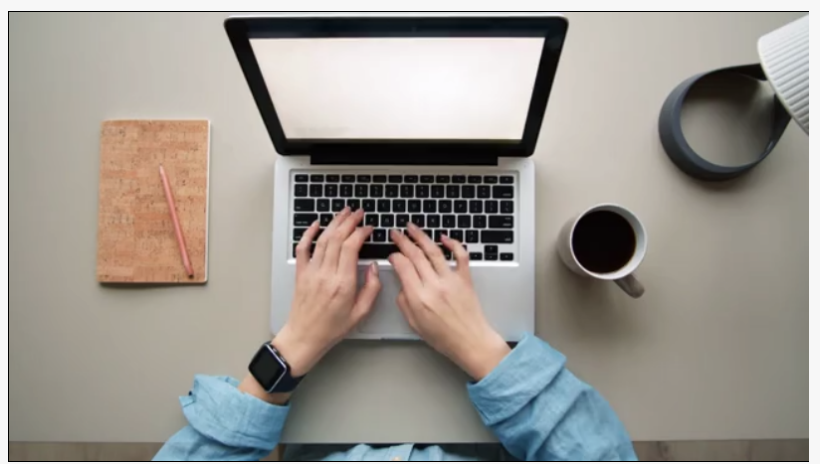
Arlington Health Insurance Agent

Insurance4Dallas 2131 North Collins, Suite 433-517 Arlington, TX 76011