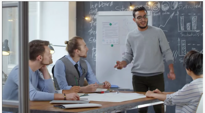
Arlington Insurance Corpus Christi