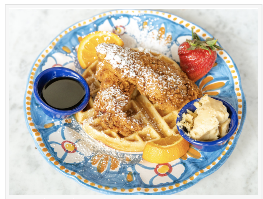
Anzie Blue