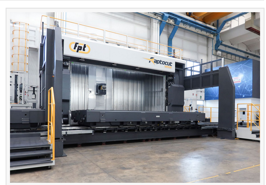
Michigan-based MERRILL installs the first RAPTOCUT milling machine in the United States through a partnership with Fadal and FPT Industrie

ROCHESTER HILLS, MI, UNITED STATES, January 18, 2022 /EINPresswire.com/ -- America's first RAPTOCUT milling machine was installed into MERRILL's portfolio thanks to a partnership with FPT Industrie S.p.A. and Fadal Engineering. The machining companies joined forces to integrate the revolutionary machine into MERRILL's large component machining facility.