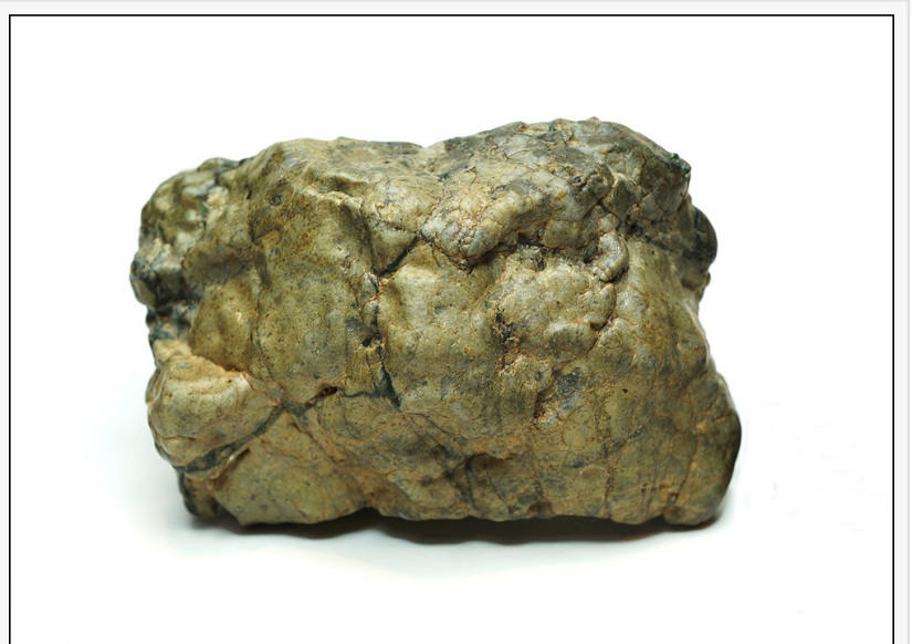
Alternate view of the NWA 8687 lunar meteorite included with the NFT

This press release can be viewed online at: https://www.einpresswire.com/article/560931950