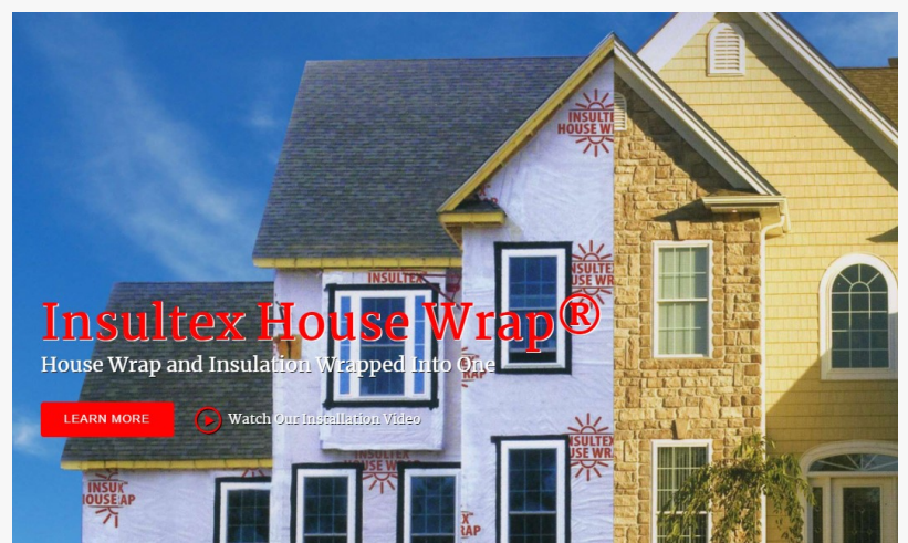
IVDN Insultex House Wrap

From an investment perspective, IVDN has a very attractive share structure with only about 33