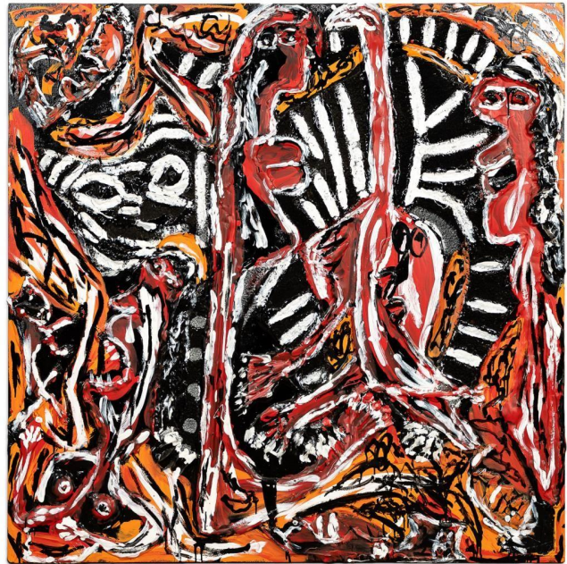
Paint and mixed media on canvas by Thornton Dial (American, 1928-2016), titled Struggling Tiger (The Tiger Penned In) titled on verso, 60 inches by 60 inches ($84,700).