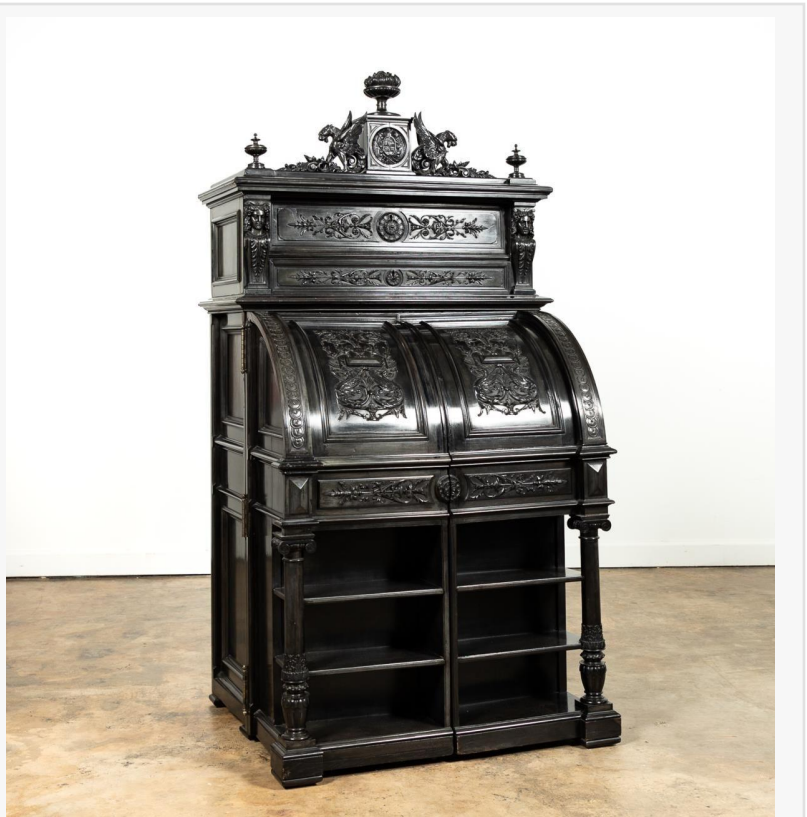
Renaissance Revival cabinet secretary desk, made circa 1874-1876 by The Wooten Desk Company and previously owned by the President of Uruguay ($37,200).