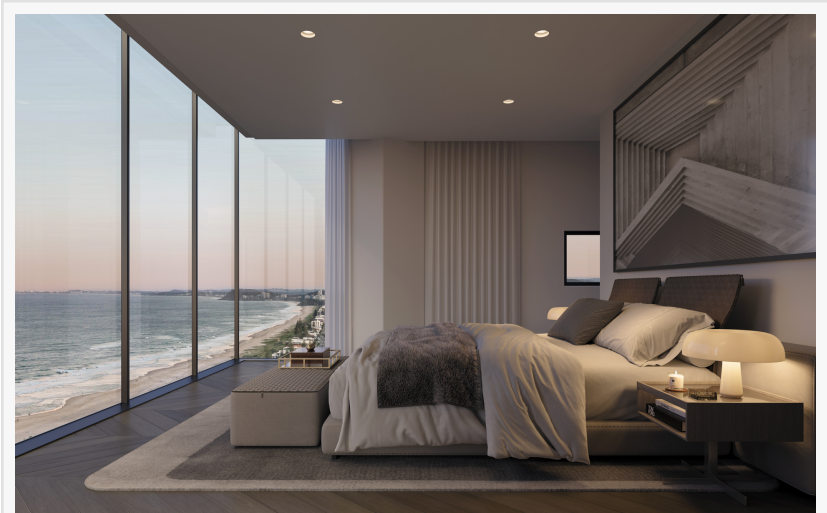
An artist impression of the master bedroom with beach views at LUXE Broadbeach.

GOLD COAST, QUEENSLAND, AUSTRALIA, January 20, 2022 /EINPresswire.com/ -- Six-star residential tower LUXE Broadbeach is on display at a luxury sales and experience centre now open on Charles Avenue in lifestyle destination Broadbeach on the Gold Coast.