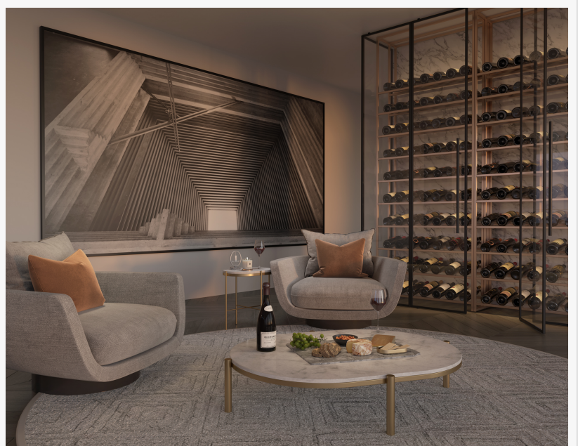
An artist impression of the wine room in one of LUXE Broadbeach's floorplans

“Our sales and development teams have worked alongside our award-winning architectural and interior design consultants at DBI to create a display that showcases all the features that make LUXE a six-star building.”