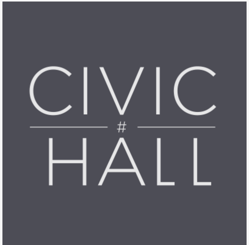
Civic Hall logo