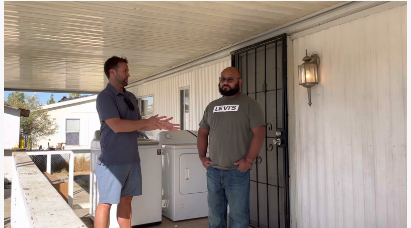
A photo from one of Mobile Home Dreamin' client's testimony.

HEMET, CALIFORNIA, UNITED STATES, January 21, 2022 /EINPresswire.com/ -- Mobile Home Dreamin' today announced a major milestone selling their 50th mobile home in three years! This milestone is a major move for Mobile Home Dreamin' on its mission to buy 100 mobile homes for cash by the end of 2023!